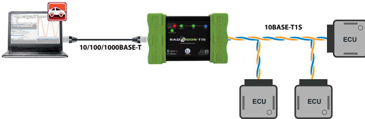
RAD-Moon T1S as a 10BASE-T1S Media Converter

The RAD-Moon T1S is a media converter for developing and testing 10BASE-T1S communication in automotive systems. It bridges a single twisted pair of a 10BASE-T1S multidrop network to the standard 10/100/1000BASE-T Ethernet port of a laptop for observing network activity using Wireshark or Vehicle Spy. It can also be used to bridge 10BASE-T1S networks to testing and simulation devices that do not have native 10BASE-T1S ports.